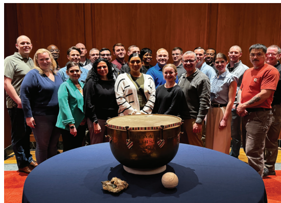
The OSW IRT Team stands around the curated exhibits presented to the team.