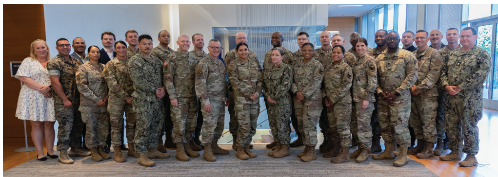
The Innovative Readiness Training (IRT) Office of the Secretary of War team at the conclusion of the 2025 Joint Workshop for Operational Mission Planners and Mission Leads.

As we begin 2026, the IRT program is preparing for another impactful year of real-world military training. This year, IRT will execute 22 training activities funded by the Office of the Secretary of War (OSW) across 16 states and territories, along with 5 additional training activities across 4 states which are not funded by OSW. The program anticipates training approximately 2,300 Service members and expects more non-funded training opportunities to emerge in the coming months. These training activities will provide no-cost services ranging from optometry and dental care to specialized diving operations and cybersecurity expertise, while helping Service members hone critical skills in realistic deployment settings and deliver essential services to communities in need.