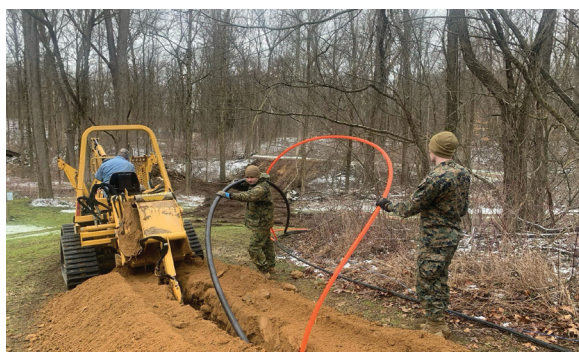
Marines from the Engineer Services Company, Combat Logistics Battalion 25, Red Bank, New Jersey, lay conduit at Camp Tamarack in Jones, Michigan.

Service members from the Engineer Services Company, Combat Logistics Battalion 25, and the 1436 Engineer Company, 507 Engineer Battalion participated in this training. The Scout camp required additional space to expand the activities offered and update existing buildings. As part of their mission, the Marines expanded Camp Tamarack's usable land, clearing more than six acres of land by felling trees. They trenched and reburied 48,000 cubic feet of soil to emplace 3,200 linear feet of electrical, water, and data conduits, and cleared more than six acres of land by felling trees. After the Marines departed, Soldiers expanded the main driveway by 13 feet in width and 500 feet in length, placed 375 cubic yards of crushed asphalt, and conducted a site survey to assist in future camp infrastructure planning.