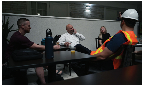
Service members who disguised themselves in preparation for a full-scope penetration test discuss physical intrusion plans.

From May 6-15, the Air Force Reserve Command (AFRC) partnered with the Nueces County Courts for a full-scope penetration test in Corpus Christi, Texas. The United States Air Force (USAF) supported this mission to assess the county's network and cloud assets. Specifically, five AFRC units, one USAF unit, the Nueces County Courts, the district attorney's office, and the sheriff's office contributed to the mission's success.