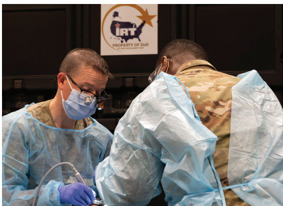
Mission participants provide no-cost dental services during Arctic Care 2024 in Kodiak, Alaska.

This successful collaboration exemplifies how IRT partnerships benefit communities and contribute to unit readiness through real-world mission training. Learn more about our program at irt.defense.gov .