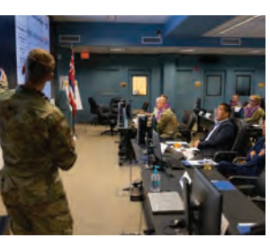
Sixty-eight IRT civil military partnerships delivered training value to the Joint Services while assisting 36 United States and Territories.

and Territories, Civil Affairs: 1 civil military partnership in the State of Texas.