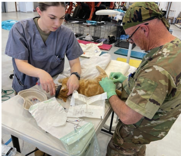
Service Members receive veterinary training

From June 13 to June 22, the Army Reserve led the Operation Walking Shield: Round Valley Indian Health mission to provide no-cost dental, medical, and veterinary services to the Round Valley community. The Marine Corps Reserve, Navy Reserve, and Air National Guard supported this joint mission to provide medical services and communications capability.