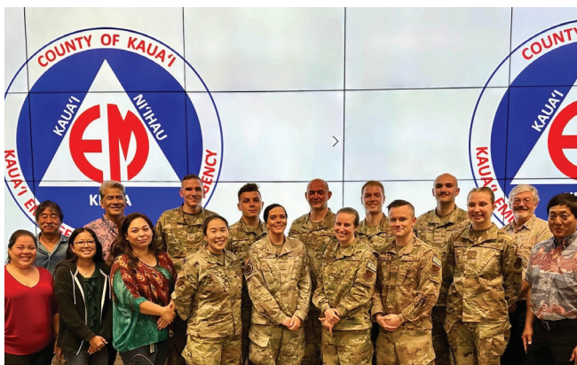
Air National Guard Supports Emergency Management Planning in Hawaii

From April 23, 2023 to May 6, 2023, the Air National Guard (ANG) led the Kaua'i Emergency Management Agency—Operations Plan Update mission to provide no-cost administrative and technical support to the Kaua'i community. The Utah 151st Air Refueling Wing, California 163rd Civil Engineering Squadron (CES), Iowa 185th CES, and the Vermont 158th CES ANG units collaborated on this joint mission to provide assistance in updating and publishing the county's Emergency Operations Plan (EOP).