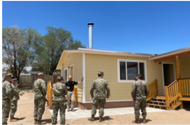
Service Members perform a walkthrough of a Navajo family house constructed during IRT's Operation Footprint mission in Gallup, New Mexico

From 01 March to 30 April, the Navy Reserve led a civil-military partnership with the State of New Mexico for construction services to assist Navajo families with housing challenges. Dubbed “Operation Footprint,” this civil engineering mission trained 194 Navy Reserve sailors, supported by 168 Army National Guard members in Gallup, New Mexico.