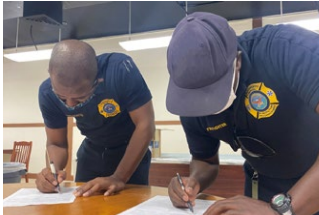
Effective IRT missions begin with a strong community application.

Innovative Readiness Training (IRT) is a collaborative program that leverages community resources and military contributions to multiply value and cost savings for all participants. This civil-military partnership program provides an opportunity for American communities to receive lasting benefits in areas of health care, construction, civil affairs, cybersecurity, aerial spraying, transportation, and diving while military personnel receive hands-on, real-world training to improve deployment readiness and survivability.