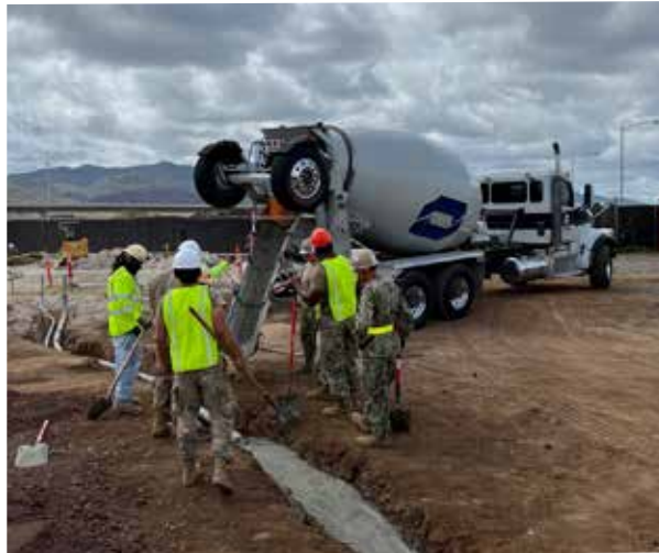
Service Members lay the foundation for the Special Olympics Hawai'i Health and Fitness Building and Play Court at the IRT construction site in Kapolei, Hawai'i.

From June 12 through September 24, Air Force Reserve Command (AFRC) Service Members led a partnership with Special Olympics Hawai'i for "Fulfilling a Dream: ...Special Olympics Hawai'i 2022" to supply no-cost civil engineering support in constructing a multipurpose sports, education, fitness, and wellness community center in Kapolei. This joint mission was a collaborative effort with the Army National Guard, Navy Reserve, and Air National Guard to provide real-world training in horizontal and vertical construction, electrical and utilities work, preventative maintenance, construction management, heavy equipment operations, and facilities operations. The civil-military partnership enhanced deployment readiness and occupational specialties of Service Members while creating accessible, state-of-the-art facilities for persons with disabilities.