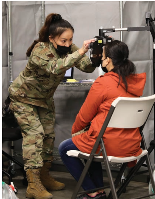
Kodiak Arctic Care mission participant provides an eye exam to a patient.

Innovative Readiness Training has partnered with KANA previously and the mission would not have been possible without their support. KANA provides integrated wellness services to the entire Kodiak Island community. Their focus is on Alaska Native beneficiaries and specific healthcare issues that may arise within the Native community. Service Members were not only able to receive training for real-world deployment conditions, but they were also able to take part in community building—meeting and interacting with the community they were assisting. IRT's mission has helped foster a deep connection between Service Members and the community, build cultural awareness, and establish lasting relationships.