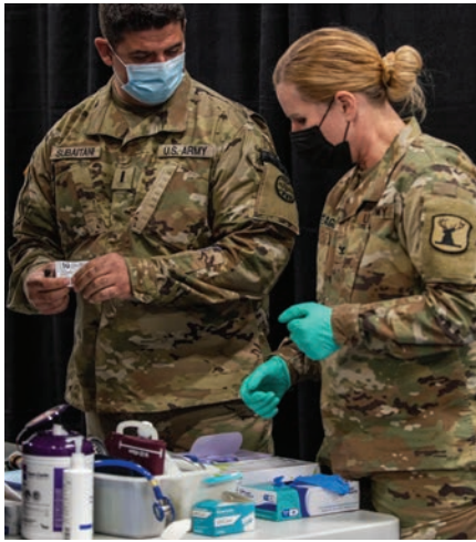
Idaho National Guard medical and dental citizen-Soldiers and Airmen teamed up with Nez Perce Tribe and Nimiipuu Health personnel as part of a larger effort to recover from the summer’s surge of COVID-19 cases plaguing northern Idaho.

The Air National Guard will lead this partnership with Ability Works, Inc., to train engineering site surveyors and heavy equipment operators in the construction and development of drainage, parking lots, tractor trailer operations, and concrete placement.