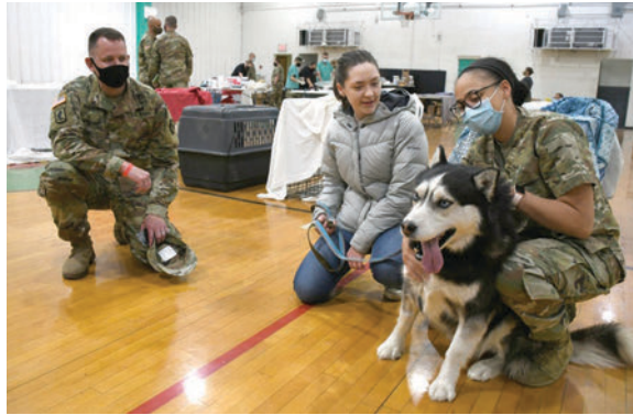
Veterinary services provided by 735th Veterinarian Det. and Turtle Mountain Animal Rescue at Turtle Mountain IHS/Operation Walking Shield mission in North Dakota

New and repeat civil-military partnerships in FY 2022 will build on IRT's prior successes. As FY 2021 ends, the joint service IRT program managers convened individual preparatory workshops to share strategies, lessons learned, and other resources. These forums equipped participants and mission planners for supporting more than 37 missions across 17 states in the months ahead.