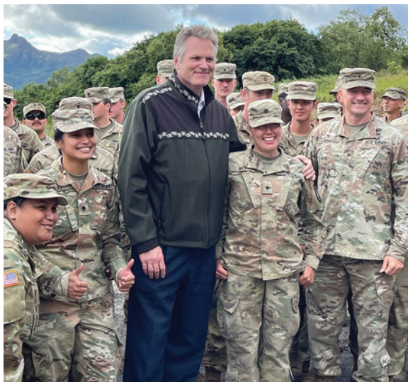
Alaska Governor Mike Dunleavy visited members of the US Army Reserve at Old Harbor Distinguished Visitor's Day

Training through partnerships such as this is unique in DoD. It is hands on, simulates real tasks for exercises, and offers leadership opportunities for junior officers and enlisted personnel in a joint environment. Want to learn more about our missions and the training value they deliver? Visit our website at irt.defense.gov .