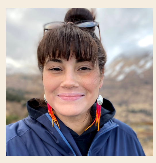
"I was honored to serve as the community partner point of contact to help plan Arctic Care 2021, which brought no-cost healthcare services to the communities of Kodiak Island, Alaska. Being a part of this mission allowed me to give back to my community in such a meaningful way, in addition to giving me the opportunity to meet and work alongside so many dedicated and passionate people; this has been the highlight of my career."