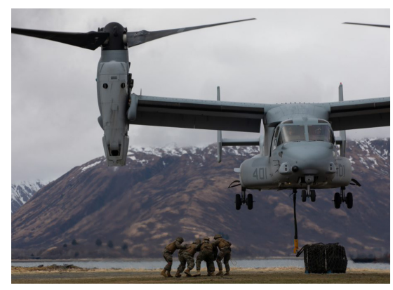
U.S. Marines with VMM-764, 4th Marine Aircraft Wing, provided logistical support by conducting external sling loads with an MV-22 Osprey in Kodiak, Alaska.

From May 3 through May 15, Air Force Active Duty Service Members partnered with the Kodiak Area Native Association (KANA) to deliver no-cost medical services to residents across seven sites of care in Alaska's remote Kodiak Island borough. This joint mission included support from the Army Reserve, Army National Guard, Marine Corps Reserve, Navy Reserve, and Air National Guard. Training opportunities in medical, air lift, logistics, veterinary, civil affairs, and communications specialties sustained readiness for 514 Service Members while treating 2,156 patients and accomplishing 11,406 procedures; including fabrication and distribution of 631 pairs of eyeglasses.