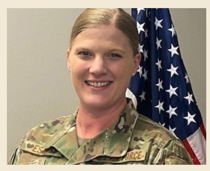
"I have had the pleasure of working with the IRT program since 2017, giving the reserve Airmen that worked with me the opportunity to train and hone their skills for over the road transportation. For the last eight months, I have been part of Asset Management, and have gotten to see the full scope of what IRT supports. This has allowed me the opportunity to work with all the branches of service, see the impact of the missions IRT has supported, and get to know some of our community partners. I am truly blessed to be a part of this amazing program and hope to keep supporting it in the future."