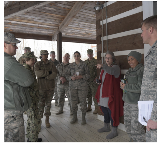
While many have gone virtual due to COVID-19, planning meetings are typically held in person between IRT mission planners and the community. (Pre-Pandemic Appalachian Care 2019 IPM)

The decisions, challenges, and outcomes encountered during IRT planning meetings are not unlike those faced when preparing for deployment overseas. Participants work through all elements of mission planning to identify and coordinate preparation efforts for food services, bed-down locations, equipment, fuel needs, administrative items, and more. Certain mission types have